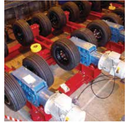
Sepro Pneumatic Tyre Drive System (PTD)