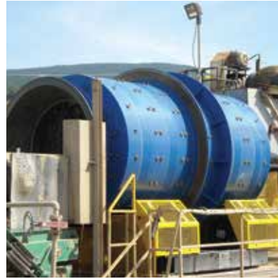
2.4 x 4.2 Sepro Scrubber

*Engineered replacement for North American built 8 ft. x 14 ft. Scrubber.